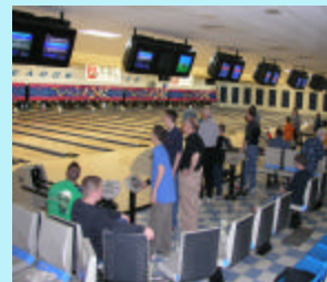
Checking out scores