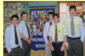
2003-2004 Key Club Officers

The above pictures are just a few of the activities our club participated in during the month of April.