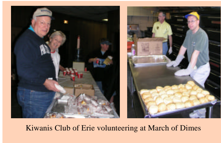
Kiwanis Club of Erie volunteering at March of Dimes