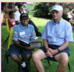
Members read at the Neighborhood Art house two days a week during the month. What a great time everyone had.