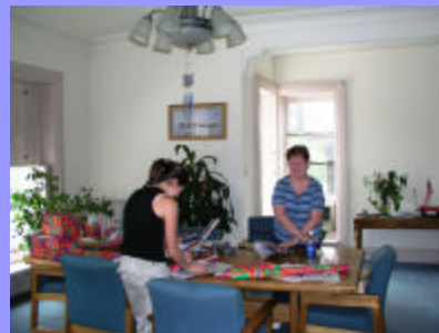
Members and family wrapping gifts for Christmas in July!