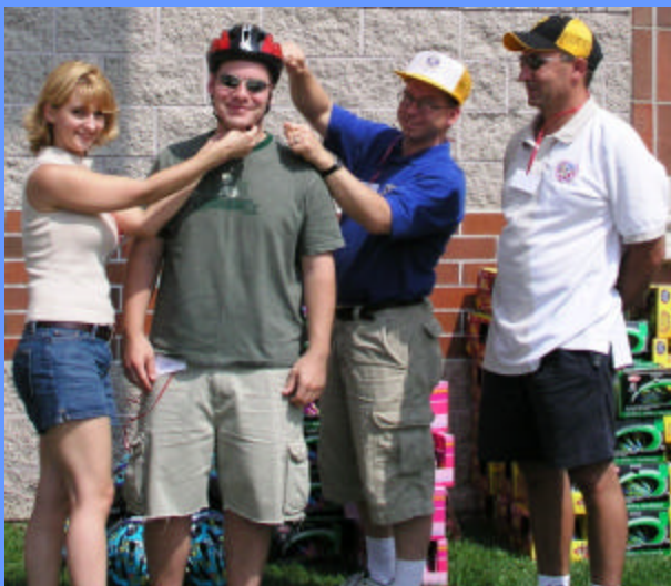
Our members helped with Red Cross Safe Kids Day at the Bike Rodeo.