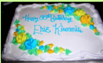
Happy Birthday Kiwanis Club of Erie