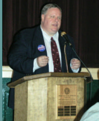
Congressman English spoke to our group about Legislative Updates. He also put a emphasis on Trade, Jobs & the Economy.