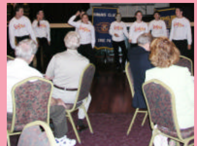
Youth Theatre preformed at our birthday party!